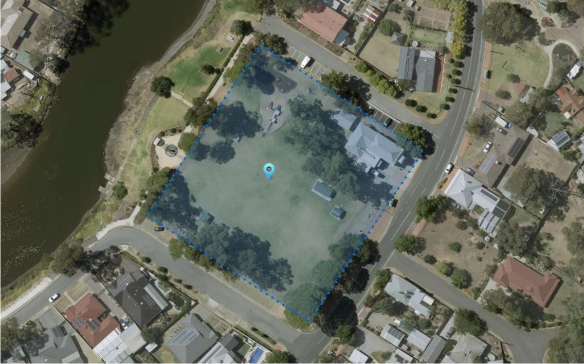
Site of Market Reserve, now Lot 97 Patapinda Road, Noarlunga (Planning SA SAPPa)