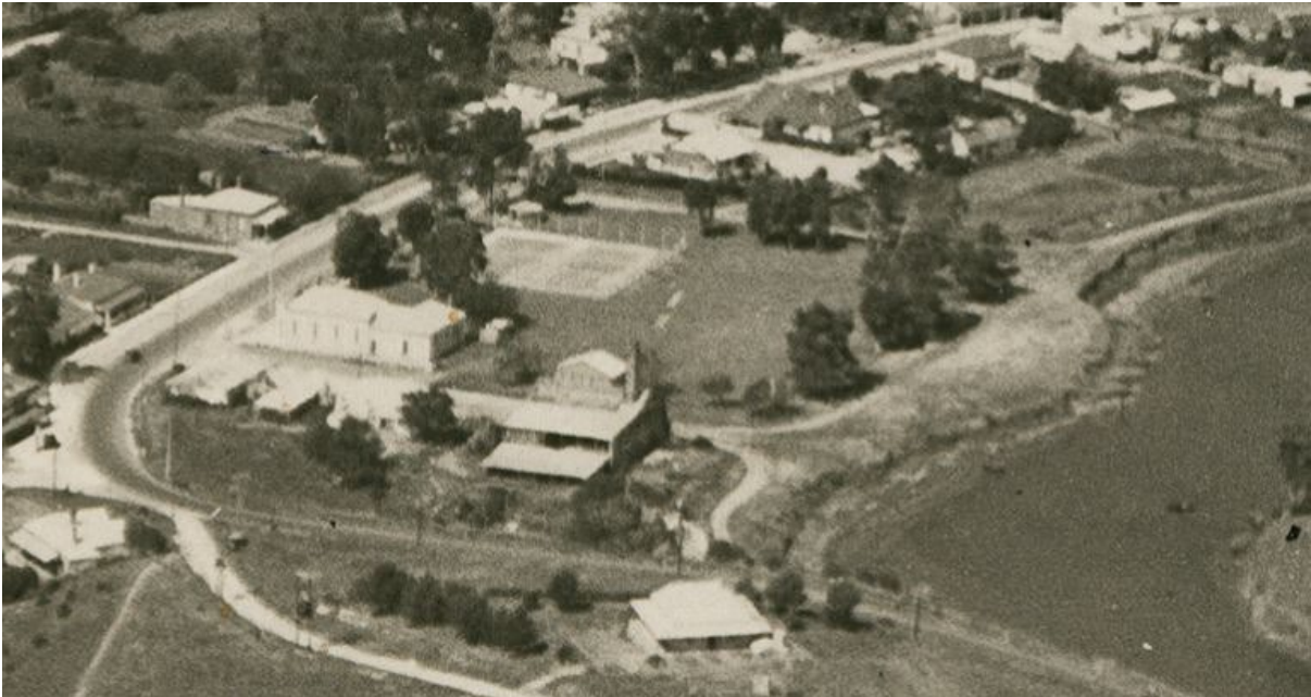
Market Reserve site in an aerial photograph taken in c.1937 (SLSA B 7242).