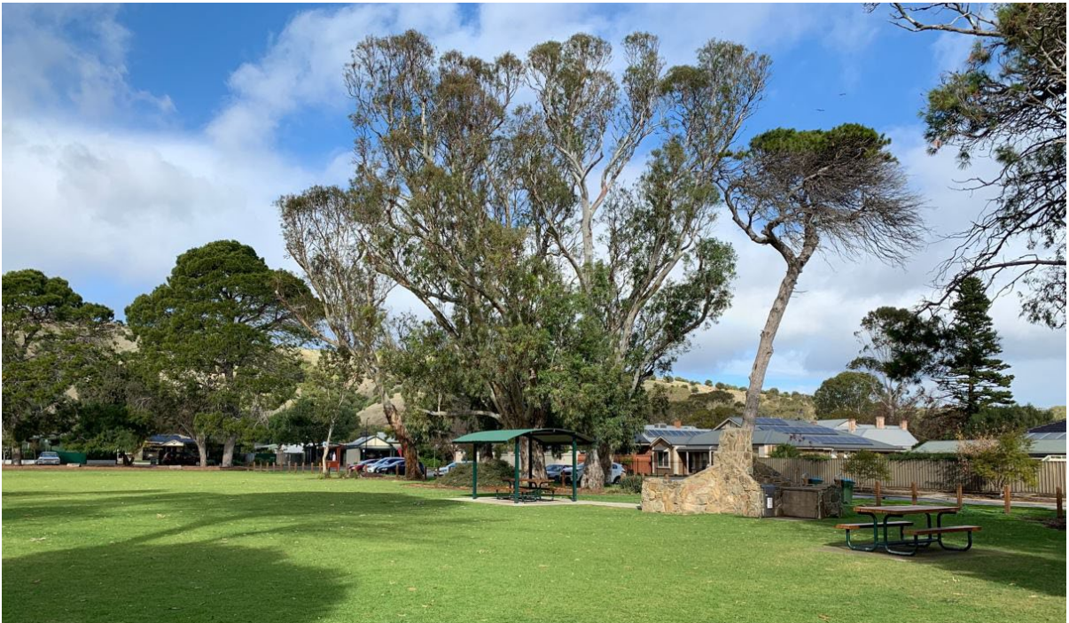
Market Reserve, Lot 97 Patapinda Road, Old Noarlunga, looking south-west (GGA, 2021).