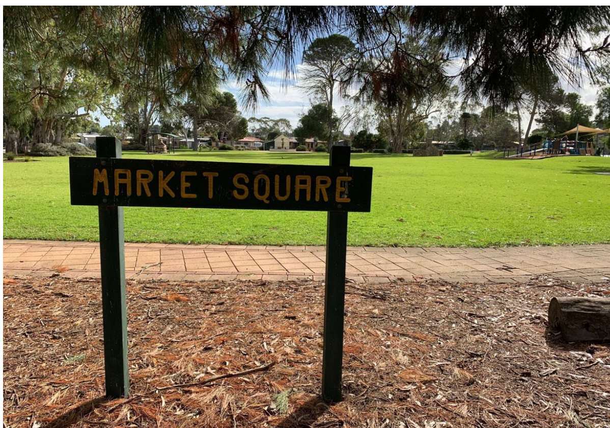
'Market Reserve', Lot 97 Patapinda Road, Old Noarlunga (GGA, 2021)