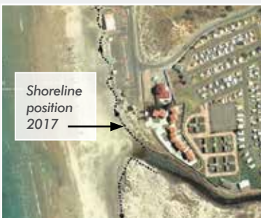
The foreshore layout was changed in the 1990s and dunes installed to the foreshore. Moana 1989.

Historical analysis demonstrates cycles of erosion and accretion. Human interventions are also observed.