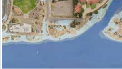
Moana beach extreme event 2020

Example: the flood event of 9 May 2016 was close to what is known as a 1-in-100-year extreme event. If seas rise as projected by 2100, events like this are likely to occur every month. Extreme events in 2100 would be likely to flood Pedler Creek and the caravan park in a similar pattern as depicted. The sand dunes would also be likely to erode.