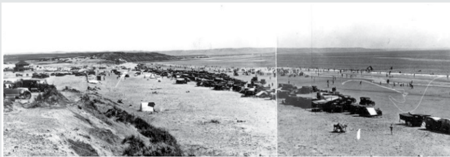
Moana beach 1929

We compared aerial photographs of Moana beach from 1949–2018 to measure how much the coastline has moved and changed. Where available, we also used older land-based photography to assess changes to the coast. For example, the photos below show that the soft sediment dune backshores have been modified to hard surfaces.