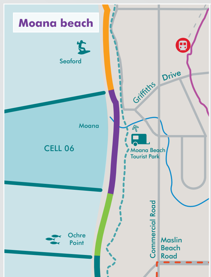
Cell: 06 Moana beach

Onkaparinga's coastline is of significant cultural, social, environmental and economic value to the Kurna people, our wider communities and visitors.