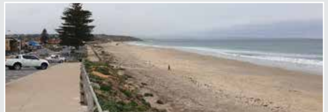
Moana beach 2020

Historical analysis demonstrates cycles of erosion and accretion. Human interventions are also observed.