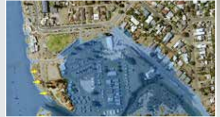
Pedler Creek extreme event 2100