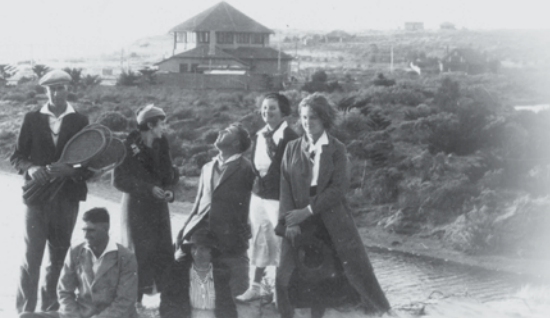
Pedler Creek outlet, Moana beach, South Australia, 1933

For example, a low-lying freshwater ecosystem would be disrupted if sea water flowed into the area.