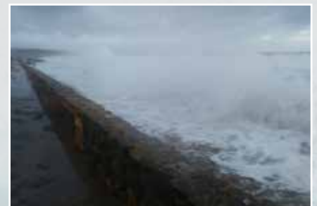
Storm impact 9 May 2016