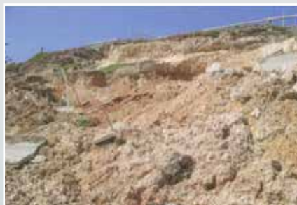
Cliff and walkway collapse 4 July 2007

At Moana, the 9 May 2016 storm had a significant impact on the seawall. Water flowed through the gaps in the wall leaving a trail of seaweed debris and flowed up the ramps and stairs in front of the Moana Surf Life Saving Club which required sandbagging at its entrances. Water flowed up Pedler Creek and caused minor flooding on Nashwauk Terrace.