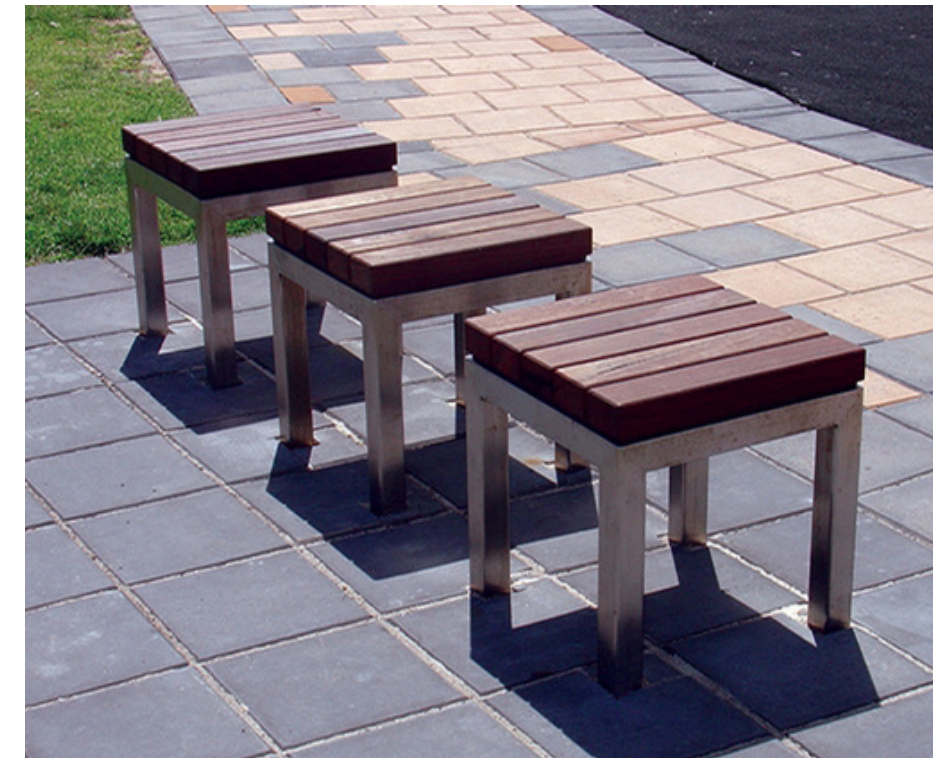
Shoreline Cube - 450mm x 450mm Spark Furniture