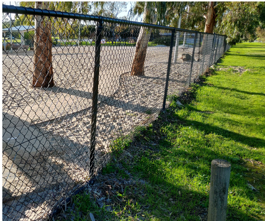
Chain mesh fence - black colour Fieldquip