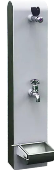
PF450 Pet Drinking Station Urban+FF