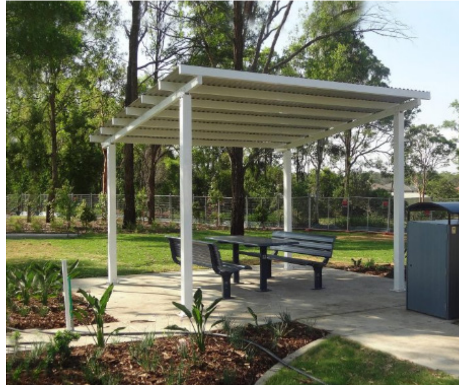
Skillion Shelter 4m x 4m Terrain Group