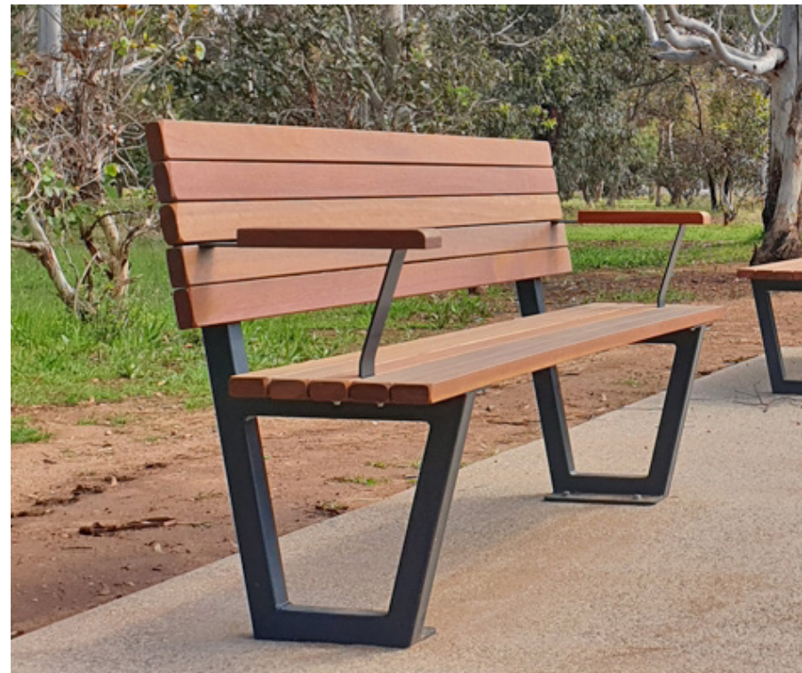
Gemtree Seat Spark Furniture