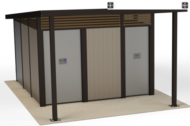
Aluminium Restroom Building - 2 pan with 1 wheelchair compliant Terrain Group