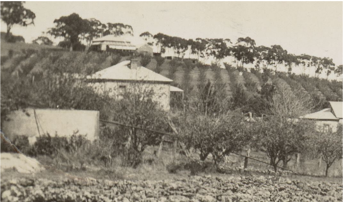
C.1920 photograph of 4 Crane Avenue, Coromandel Valley, looking south (SLSA B 28523)