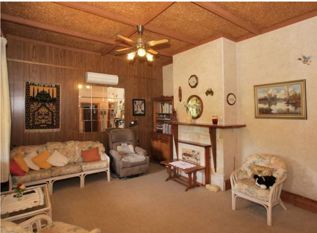
C.2010 photograph of late 20 th century internal alterations to 4 Crane Avenue, Coromandel Valley ( https://www.realestate.com.au/property/4-crane-ave-coromandel-valley-sa-5051 , accessed 18/1/2022).