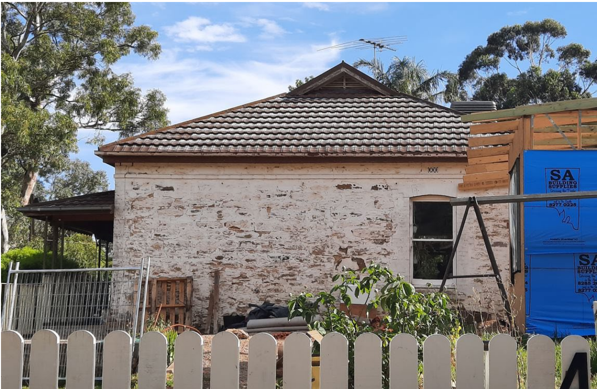
South elevation of 4 Crane Avenue, Coromandel Valley (GGA, 2021)