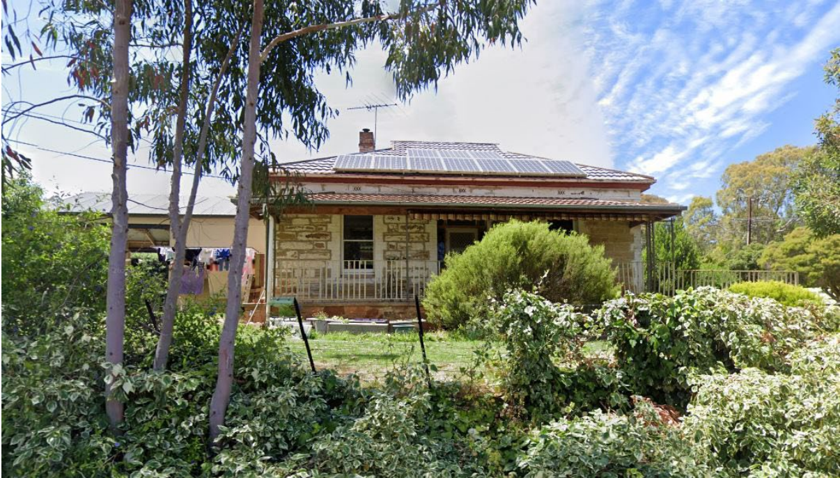
West elevation of 4 Crane Avenue, Coromandel Valley