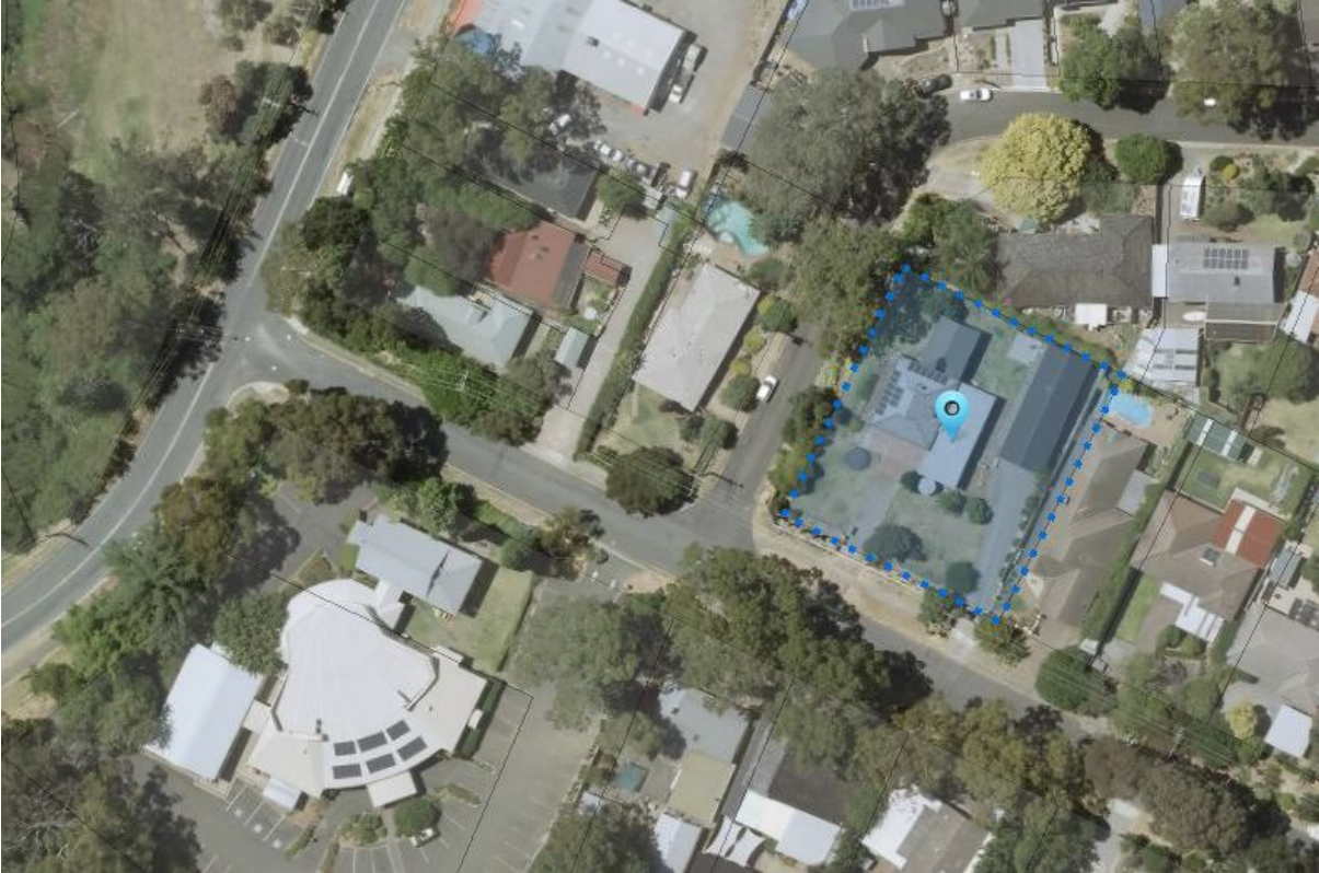
Site of 4 Crane Avenue, Coromandel Valley (Planning SA SAPPA)