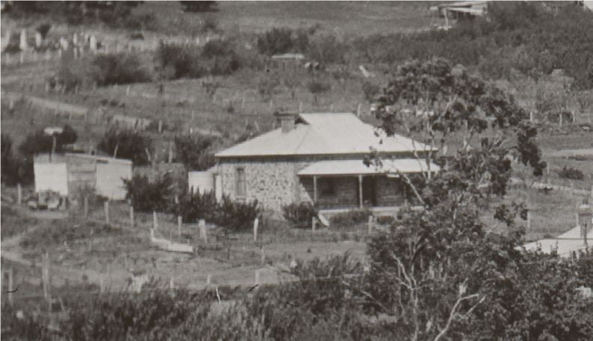
Enhanced photograph of c.1912 image of 4 Crane Avenue, Coromandel Valley