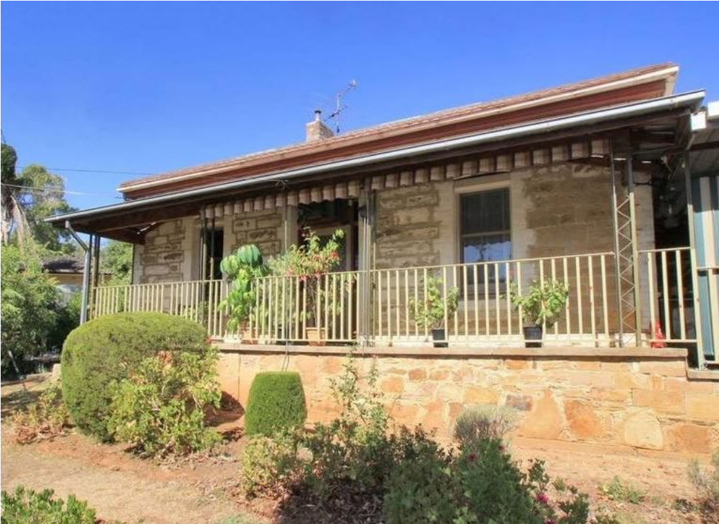
West elevation of 4 Crane Avenue, Coromandel Valley in c.2010 ( https://www.realestate.com.au/property/4-crane-ave-coromandel-valley-sa-5051 , accessed 18/1/2022).