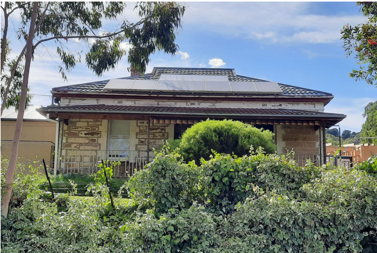
4 Crane Avenue, Coromandel Valley (GGA, 2021)

CURRENT USE: Dwelling FORMER USE: Dwelling DATE(S) OF CONSTRUCTION: C.1910 with later additions and alterations LOCATION: 4 Crane Avenue, COROMANDEL VALLEY LAND DESCRIPTION: CT 5170/827, Section 697, Hundred of Noarlunga OWNER: Private ownership RECOMMENDATION: Local Heritage Place